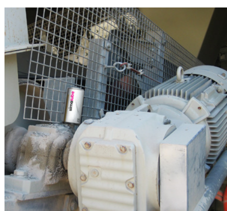
A vertical bearing on a conveyor belt is lubricated with a simalube lubricator.