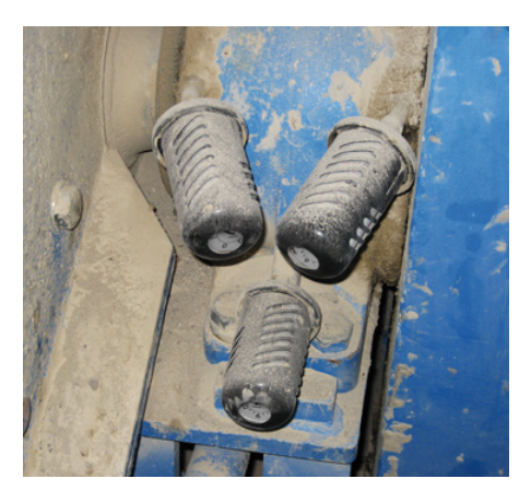
Protective caps used to prevent damage to the lubricator from harsh external conditions.