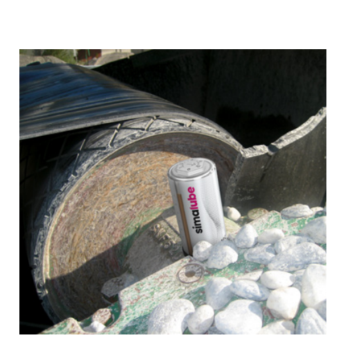
Belt drive lubricated with simalube.

«simalube reduces costs and increases safety in the workplace»