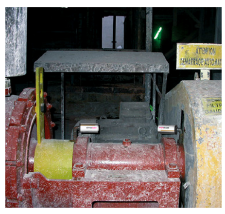
Permanent bearing lubrication on the main drive shaft of a filter pump.