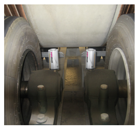
The lubricators are connected directly to the vertical bearing on the drive of a conveyor belt.