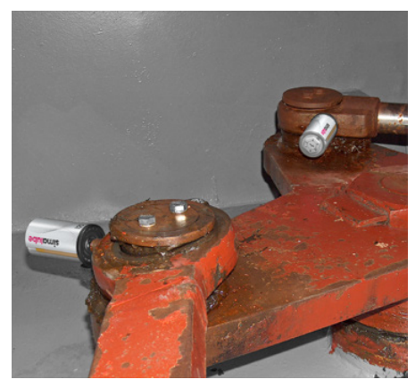
The steering wheel is lubricated with two 125 ml lubricators.