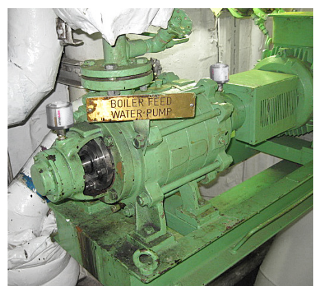
simalube 30 ml are installed on the water pumps of the boiler.