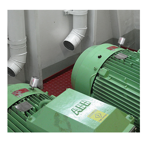
The ABB electric motors are fitted with 60 ml simalube lubricators.