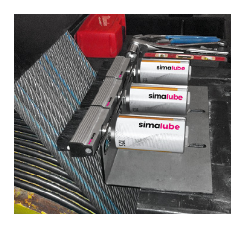
Three 125 ml simalube lubricators with brush applications both lubricate and clean the cable.