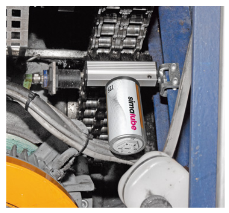
The simalube lubricator continuously oils chains, even in tight spaces. Additionally, the brush cleans the chain.