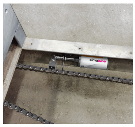
If there are space constraints, simalube can also be installed at an angle.