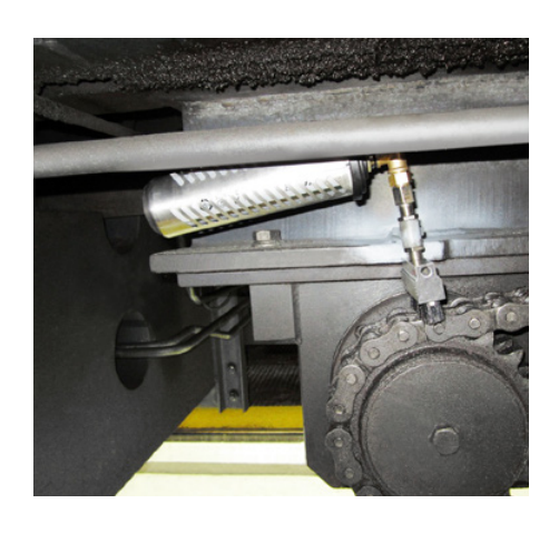
The 250 ml simalube lubricator lubricates the chain drive of a railway crane. The dispenser is also protected by a protective cover.

«Save time and improve reliability with simalube chain lubrication»