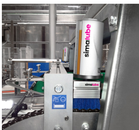
simalube and brush lubricate the chain in a brewery.