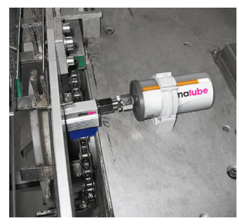
In the food industry, the special blue brush is used with food oil.