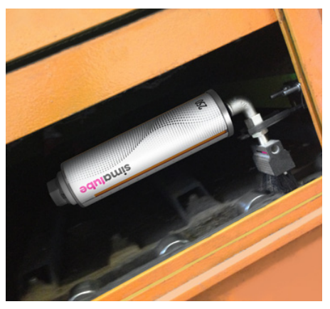
The conveyor belt chain in a recycling factory is automatically lubricated and cleaned with simalube and brush.